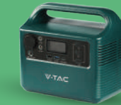
300W SKU 11441

Choose the option that best suits your needs