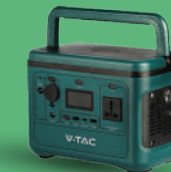
500W SKU 11442