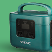
1000W SKU 11443