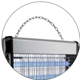
Wire chain for hanging or set it on a flat surface.